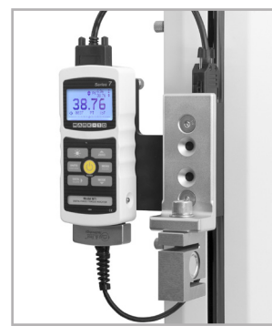
AC1062 Test stand mounting kit Adapts a Series R01 sensor to an ESM303 test stand*.