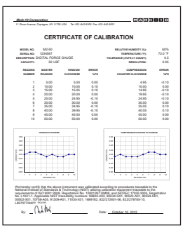
Certificate of calibration Includes 10 data points in the tension and compression directions. NIST-traceable.