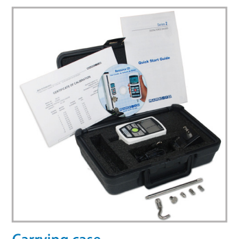
Carrying case Cushioned hard plastic carrying case provides storage space for the gauge, AC adapter, and attachments.