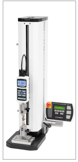
Shown with an ESM303 test stand and G1008 film & paper grips

An ergonomic, reversible aluminum design allows for hand held use or test stand mounting for more sophisticated testing requirements. Series 4 digital force gauges are directly compatible with Mark-10 test stands, grips, and software.